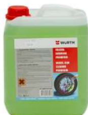
PREMIUM RIM CLEANER ART.-NO. 0893476505