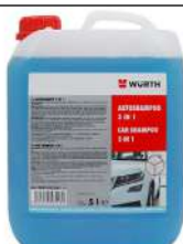
CAR SHAMPOO 3 IN 1 ART.-NO. 0893012051