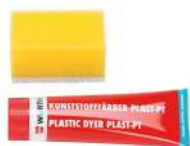
PLAST PT® PLASTIC PAINT ART.-NO. 0893270050