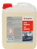
CAR SHAMPOO ART.-NO. 089301205