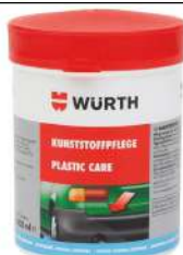
PLASTIC CARE ART.-NO. 0893477