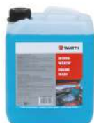
ENGINE WASH ART.-NO. 089301305