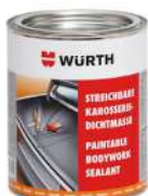
PAINTABLE BODY SEALANT ART.-NO. 0892010