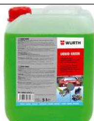
MULTI-PURPOSE CLEANER LIQUID GREEN ART.-NO. 08934731