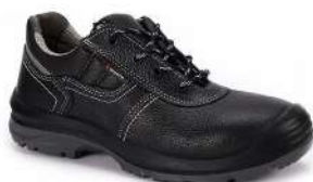
MUSTANG GREY LOW S3