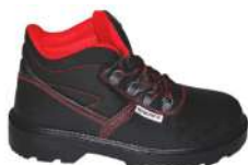
BASIC HIGH S1