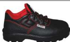
BASIC LOW S1