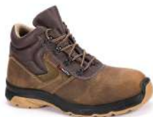
SAFETY BOOTS, MARS HIGH S3