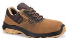
SAFETY BOOTS, MARS LOW S3