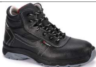
MUSTANG GREY HIGH S3